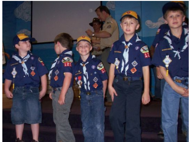
Pack 120 Scouts

The total cost of these items is around $60.00 .