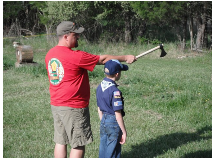
Webelos Camp 2012- Camp Shenandoah

While participating in scouting events, the safety of your son is the single most important goal of scouting and Boy Scouts of America (BSA). Programs, procedures, and guidelines are in place that dictate our activities and direct our leaders to protect your son from dangerous situations and interactions.