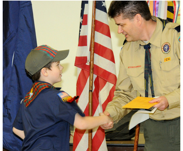
"Presenting the Award"