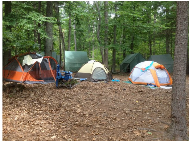
Webelos Camp 2012- Camp Shenandoah

The den leader heads up a den of scouts, usually between the ages of eight and twelve. A curriculum is now provided by BSA that provides a meeting-by-meeting schedule of events, crafts, and activities designed to move the boys through the ranks of cub scouting. A den leader is responsible for safe outings, fun meetings, and a little paperwork.