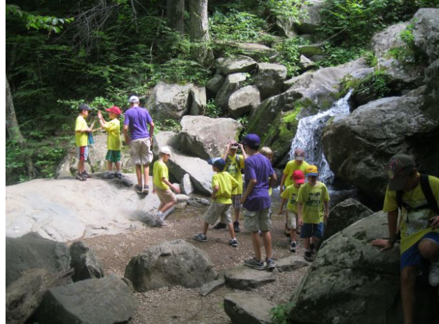
Pack Summer Hike 2011

While this training is extensive, the main components provide adequate leadership and lessons on how to eliminate threatening behaviors or situations.