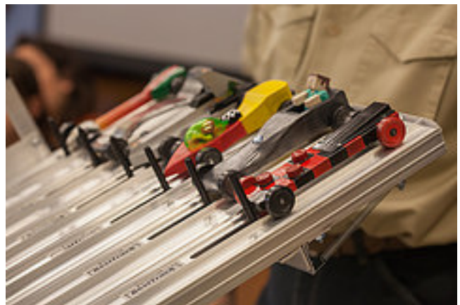
"Pinewood Derby Races"

To find more detailed information and resources on leadership roles, expectations, committees, and training, please visit: