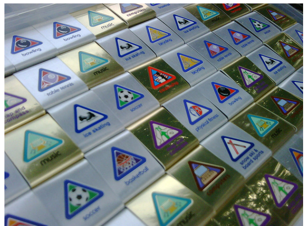
"Cub Scout Belt Loops"