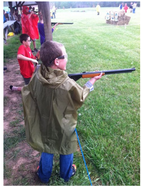
Spring Camporee 2012