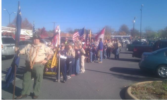
Veteran's Day Parade 2011

The cubmaster is the emcee of the pack that leads meetings and is the public face of Pack 120. A cubmaster helps all dens function properly and works with the pack committee chair to plan activities and guide the pack. While the position might seem overwhelming, there are many people in the pack that help the cubmaster plan activities, handle the “business” of the pack, and even help with meetings.