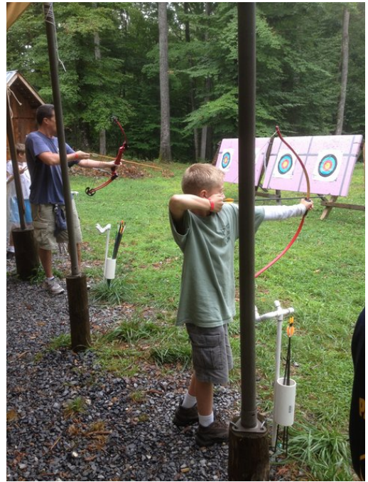
Webelos Camp 2012-Camp Shenandoah