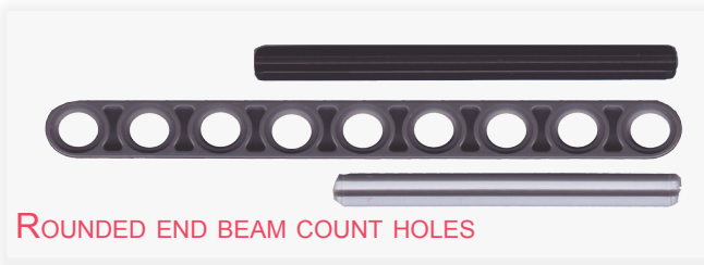
ROUNDED END BEAM COUNT HOLES