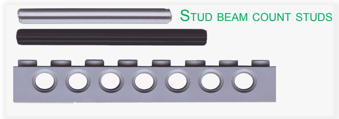
STUD BEAM COUNT STUDS

HINT: light gray axles = odd and black axles = even