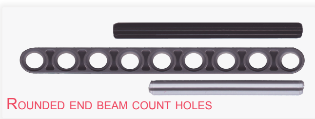
ROUNDED END BEAM COUNT HOLES