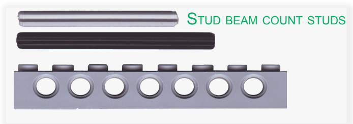
STUD BEAM COUNT STUDS

HINT: light gray axles = odd and black axles = even